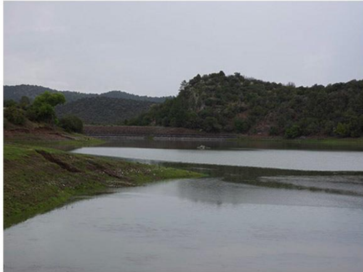
Fishing for rainbow trout was slow to fair when using spinners at Bear Canyon Lake this past week.

Young Pond: Fishing for trout was good when using salmon-peach PowerBait, chunky-cheese PowerBait and corn soaked in garlic.