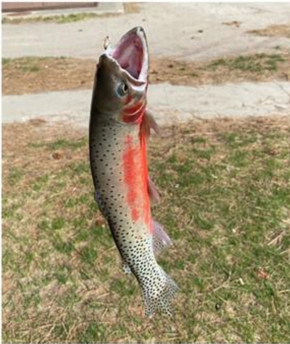
Lawrence Chavez of Albuquerque caught and released a 17-inch Rio Grande cutthroat trout using wax worms on May 13 at Fenton Lake.