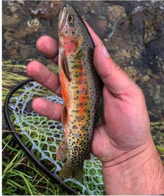
Rio Grande Cutthroat Trout