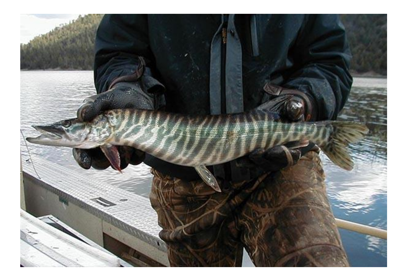
Fishing for tiger muskie was slow at Bluewater Lake last week.