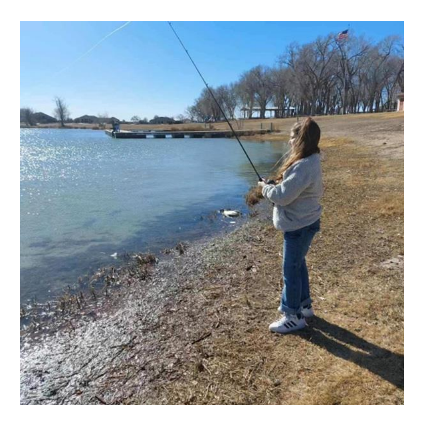
Fishing for trout was fair when using worms and PowerBait last week at Lake Van.